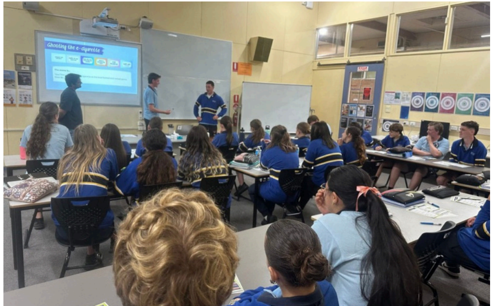
KTHS students participating in NDCH's Seeing Through the Haze Education Program.