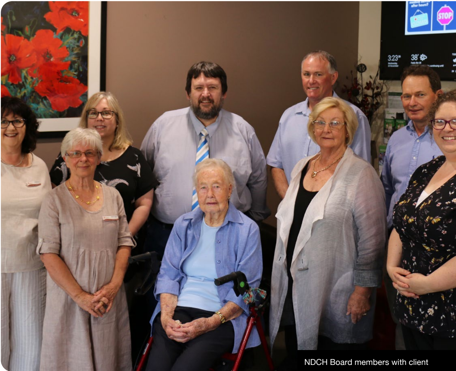
NDCH Board members with client