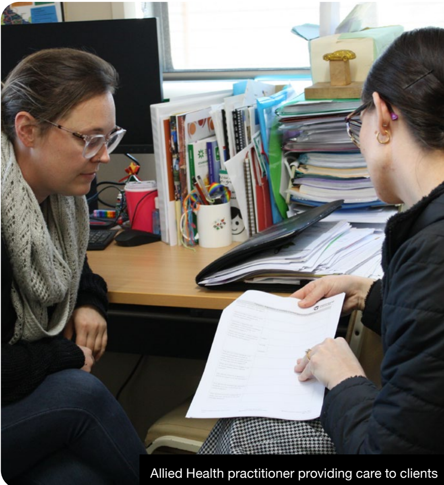
Allied Health practitioner providing care to clients