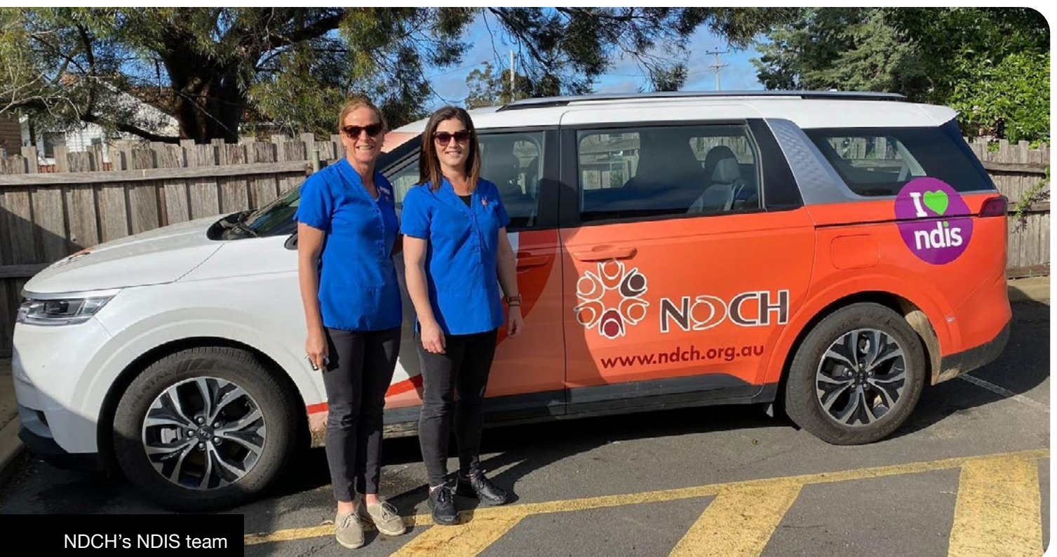
NDCH's NDIS team

We know this work makes a difference to supporting people live fulfilling, independent lives at home and connected to community.