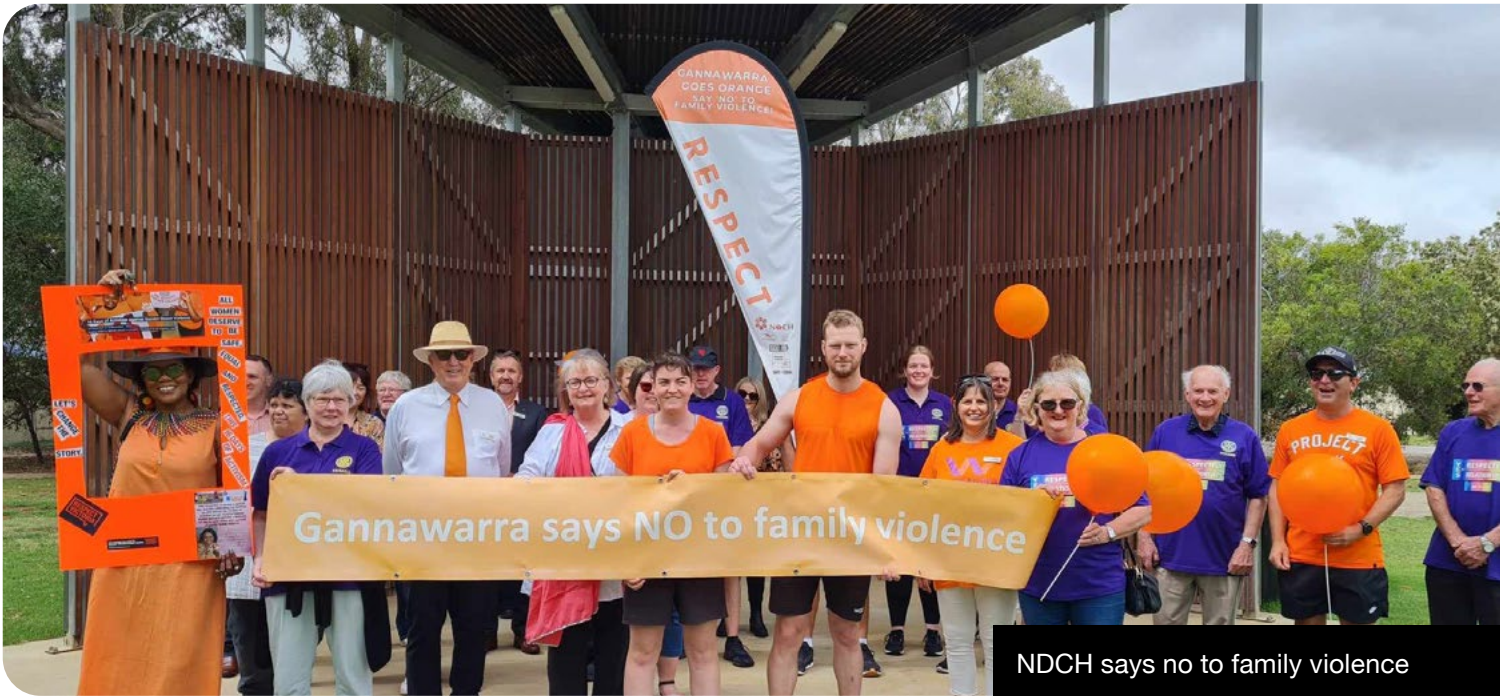
NDCH says no to family violence