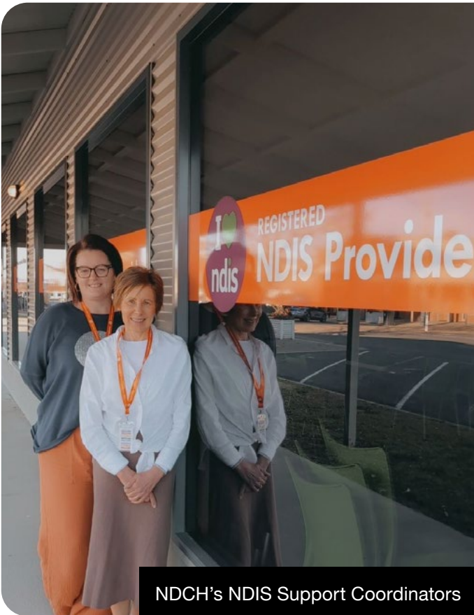
NDCH's NDIS Support Coordinators

Despite changes in the regulatory landscape, our team's expertise and commitment have remained steadfast, enhancing service offerings and fostering partnerships that further enrich our clients' lives.