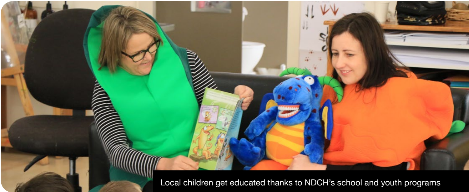
Local children get educated thanks to NDCH's school and youth programs